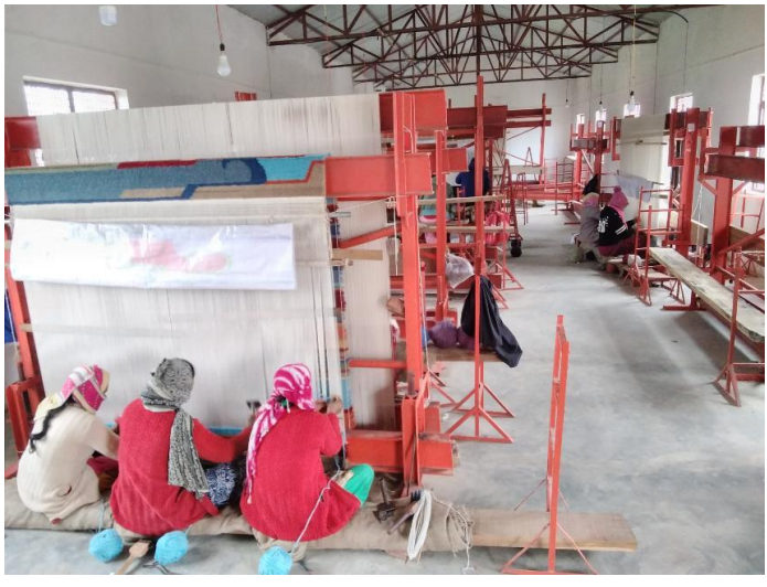
New NP Rugs Workshop in Province 2

With slow-down in the international demand for carpets, STEP continues to explore the domestic market and new international market opportunities. STEP partner R.T. Galaicha, for instance, has received bulk carpet orders from a local industry in Hetauda, Bagmati Province. In addition, STEP plans to diversify from its previous exclusive focus on custom rugs to Jodi rugs (traditional Tibetan weaving style) to tap into the carpet demand from China. For this, STEP has identified two other local weaving suppliers in Sarlahi to onboard as partners-to build their weaving capacity and enable more job creation. This month, over 100 weavers in STEP affiliated newly established workshops in Sarlahi were provided weavers empowerment training also comprising financial literacy, Fair Trade Standards, and GESI. With its steadily growing network of industry partners, Label STEP expects to create livelihoods for over 300 weavers by March 2021.