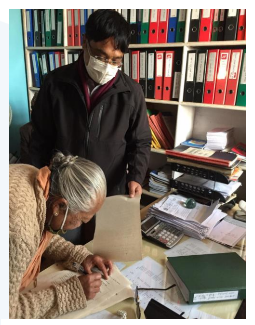
PDA formalized its MOU with the Tansen Municipality for weaving training to 100

College, and the Lord Buddha Education Foundation are the latest in a string of colleges to now offer Amazon Web Services (AWS) Cloud Computing as elective courses, along with certification, to build employability of students. With a total of 44 MoUs signed with colleges, primarily in Provinces 3, 2, 5, and 4, Genese continues to introduce courses from AWS and Microsoft to increase accessibility for thousands of students and to build teacher capability. Similarly, to improve job placement service, Genese has brokered cooperation with firms like Talent Connects, Mero Job,